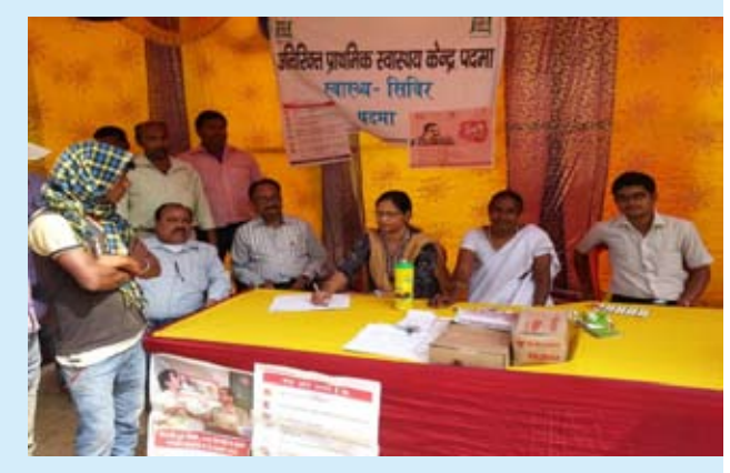
Janata Darbar Hazaribagh